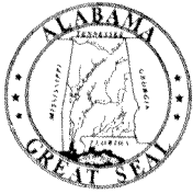
ROBERT BENTLEY Governor