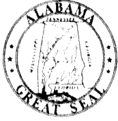
ROBERT BENTLEY Governor