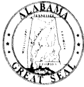
ROBERT BENTLEY Governor